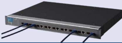
PT-G7509-F series (Front Cabling, Front Display)